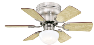
Reversible Light Maple Finish Blades