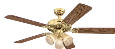
Reversible Oak Finish Blades