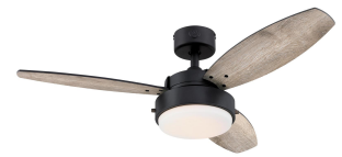
Reversible Riverbed Finish Blades