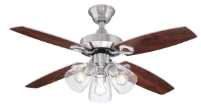
Reversible Applewood Finish Blades