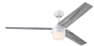
Reversible Rustic Birch Finish Blades